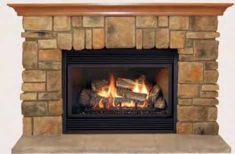
44" Opening Width | 33¼" Opening Height #4433