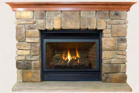
38" Opening Width | 33¼" Opening Height #3833