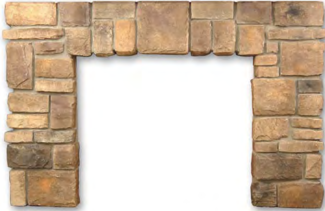
The Elk Ridge is shipped in one piece

This Elk Ridge model has each of its stones cast in their own mold to ensure consistent size and color match; they are then grouted together in the factory following the same pattern so that each finished mantle is an exact replica of the original. This stone mantel do not require special wall and floor reinforcement.