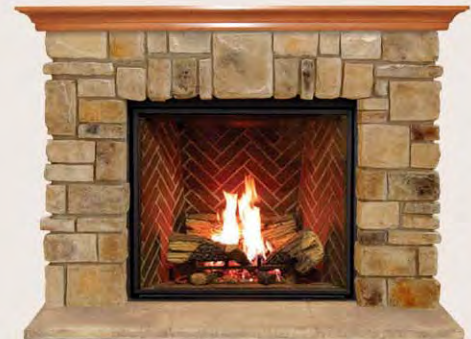
44" Opening Width | 40" Opening Height #4440