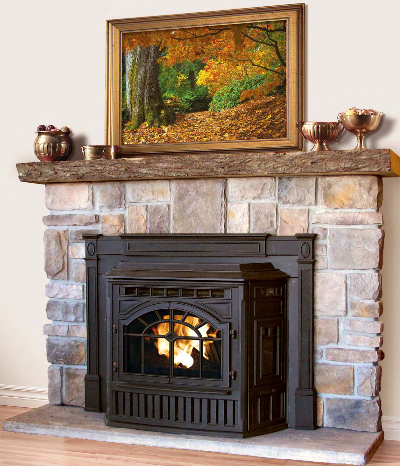
Elk Ridge with insert and logshelve