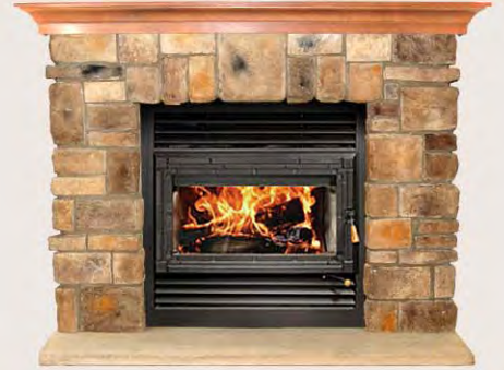
38" Opening Width | 40" Opening Height #3840